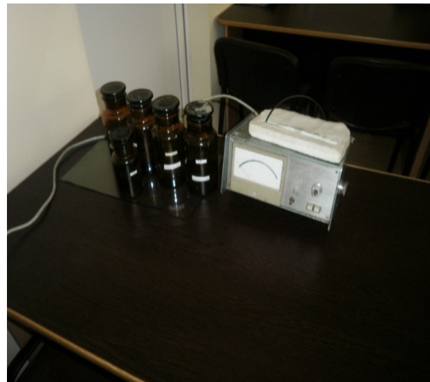
Figure 4. Conductivity meter GT12

concentration of substances, which are used as the indicator of mineralization of water. The conductivity is the property of the solutions to allow electric current to pass through them. The conductivity change when ions of different substances (salts, acids, bases) in contact with water. For rapid measurement of electrical conductivity we used conductivity meter GT12 (Figure 4) (Iușan et al.,1981; Stanci, 1999).