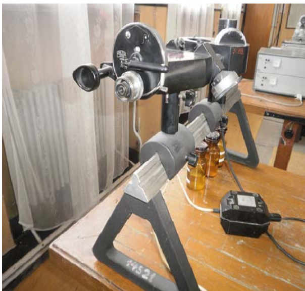
Figure 3. Photometer Pulfrich

Using Pulfrich photometer (Figure 3) was analyzed the turbidity of samples, this method is based on measuring the luminous flux intensity weakening when passing through a liquid containing solid particles in suspension which is absorbed or released (Iușan et al.,1981; Stanci, 1999).