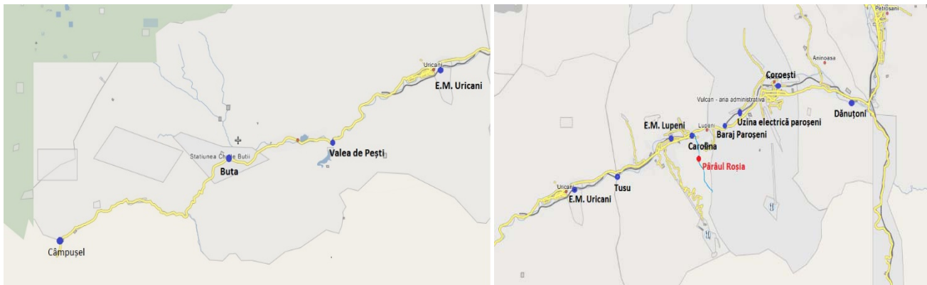
Figure 2. Location of sampling points

Using Pulfrich photometer (Figure 3) was analyzed the turbidity of samples, this method is based on measuring the luminous flux intensity weakening when passing through a liquid containing solid particles in suspension which is absorbed or released (Iușan et al.,1981; Stanci, 1999).