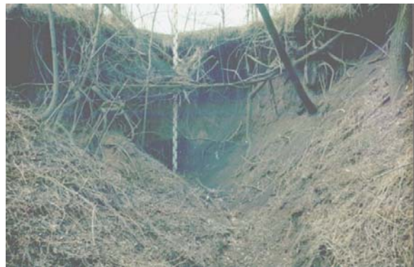
Figure 3 Gully's headcut of Tatarului Valley, Sub-Carpathians Curvature region, Buzau County, year 1997

volume necessary to combat soil erosion may vary from 20% to 60% depending on the importance of the objectives that must be protected. The gully from Tatarului Valley has a concrete check-dam of 3.5 meters high, which was identified at the distance of 32 meters from gully's headcut (Figures 3 and 4). This check-dam was not silted on its first 1.6 meters in the year 1997, and today - because of its drain holes that height has grown to almost 2 meters. In those seven years the length of this gully grew up upstream rapidly from 32 to 43 meters (Figures 3), despite the fact that the discharge of the gully's headcut has been decreasing a little bit in time.