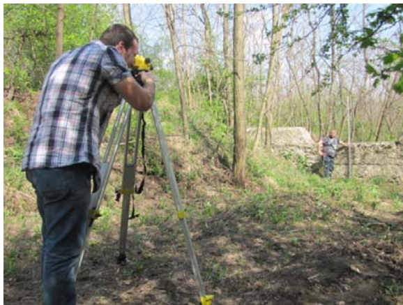
Figure 2 Topographical survey on the gully from the Tatarului Valley, Sub-Carpathians Curvature region