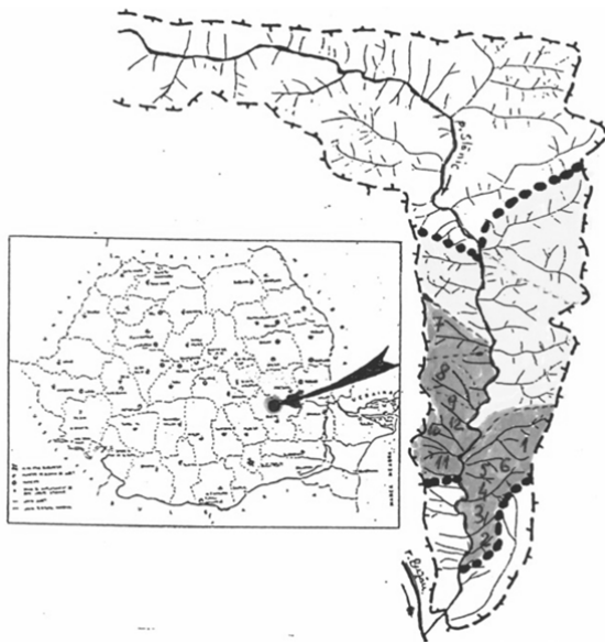
Figure 1 Sketch of the studied area, Slanic/Buzau, Sub-Carpathians Curvature region, Buzau County, Romania