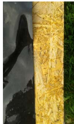
Figure 5. Putting waterproofing

Over wooden boards there have been caught the following protective layers: the top two layers consist of waterproofing membranes and insulation. Such membrane protects against seepage and provides good insulation of the roof. Over these layers to put a protective layer anti-roots for vegetation root systems do not penetrate the protective layers (Figure 5.).