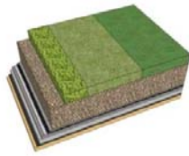
Figure 1. Design 2D

After completing the design of the panel 2D and 3D was much easier to calculate materials and costs necessary (Figure 2.)