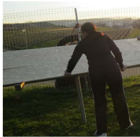
Figure 4. Making panel

Over these beams caught two of 2.5m x 1.5m wooden board, thus achieving basic roof and layout support (Figure 4).