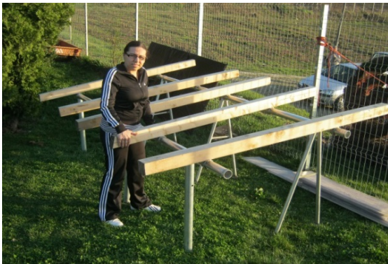
Figure 3. Installing skeleton layout

Support panel (Figure 3.) was made of pipe ZN 2 ", over which were installed five fir wood beams caught screwing 10x8 cm at a distance of 66cm from each other.