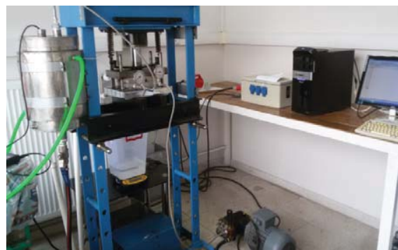
Figure 2. Cross flow flat sheet test unit in the lab scale