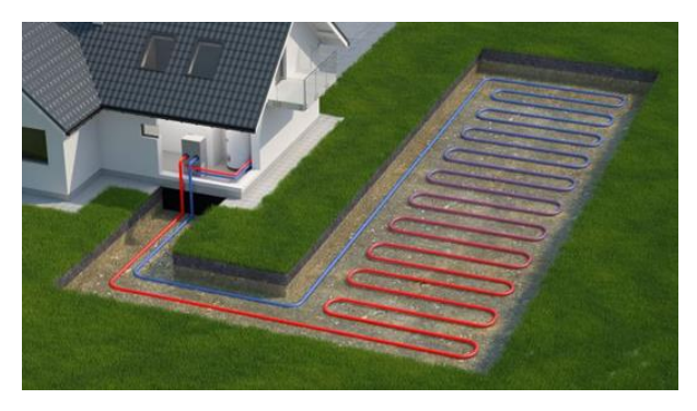
Figure 5. Heating pump water-soil

- Premium Passive House (this type of house produces more energy than it consumes, so what is produced in addition enters the network, the owner becoming a prosumer).