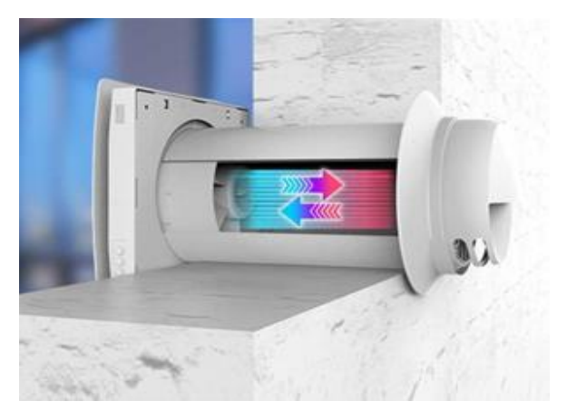
Figure 6. Ventilation system with heat recovery directly into the wall