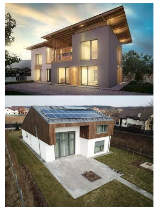
Figure 3. Examples of passive houses in Romania

Another example is Casa Buhnici, from Corbeanca, Ilfov (Figure 3. c).