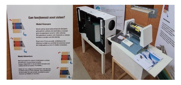
Figure 4. Ventilation system with heat recovery

The thermal insulation, sealing and controlled ventilation of the rooms add increased comfort to living conditions, in some countries with a much more suitable climate for such a project, the houses no longer need a heating system, some projects abandoning the installation for heat, focusing more on the position with respect to the sun, the thermic system and the ventilation of the rooms.