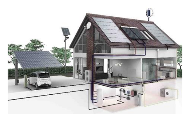
Figure 1. A modern passive house

House" are often confused, "Energy efficient house", "nZEB House".