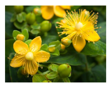
Figure 3. Hypericum Perforatum plant

anxiety, depression, chronic stress, and chronic fatigue. St. John's wort supplement balances the chemical processes in the brain and stimulates the release of hormones that induce our wellbeing.