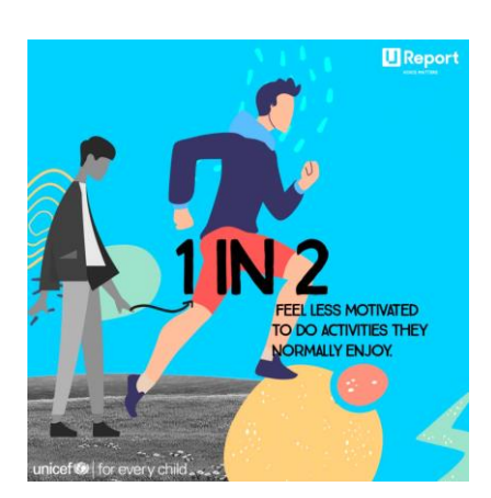
Figure 2. UNICEF poll statistics about motivation in teenagers

The isolation from friends over time, uncertainty about the future both short- and long-term, as well as a continuous state of fear, have all been evidenced to pose a risk for developing psychopathology in youth (Hafstad et. al., 2021). Family stressors pertinent to pandemic outbreak, such as parental job loss and financial insecurity, may affect adolescents in general, and in particular, those living in families with increased levels of psychosocial disadvantage. The perception of the future has also been negatively affected, particularly in the case of young women who have and are facing particular difficulties. 43% of the women feel pessimistic about the future compared to 31% of the male participants.