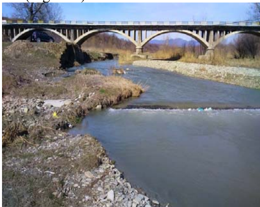
Figure 1. Teleajen riverbed

These deficiencies were caused by a serie of natural characteristics of the Teleajen river (high speed flow, large longitudinal slope), as