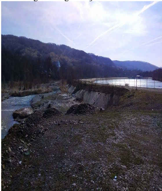
Figure 2. Deep erosions on longitudinal dike of the polder

In these conditions, the bank defense must be realized using a technical solution as simple and efficient as possible – resistant, elastic and stable to the hydraulic influences of the river stream, as well as easy to build up. The technical solution is applied both in plan and in longitudinal path, the characteristic section consists of executing a section of recalibrated