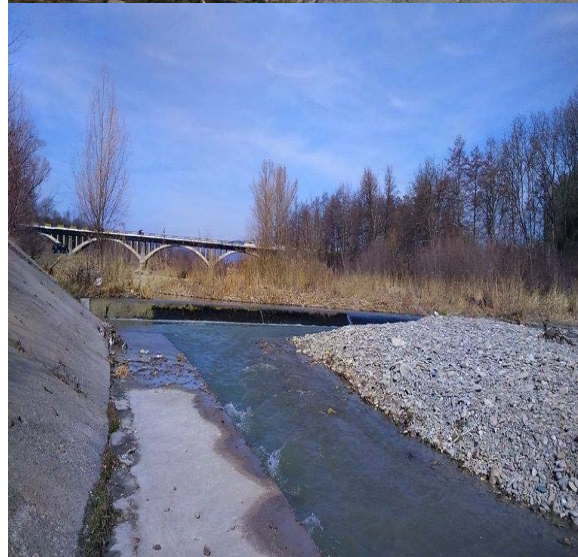
Figure 3. Concrete thresholds