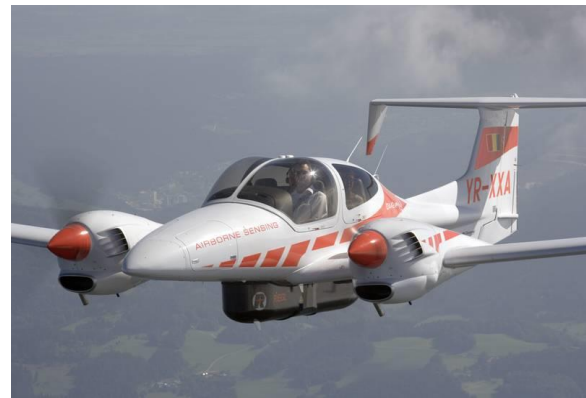
Figure 3. aircraft used for survey operations

On the surface are mounted GPS stations used at the measurements for determining the necessary data for post-processing trajectories and inertial data, at a certain density and after we place the pre-marked control points needed for conducting the aero-triangulation.