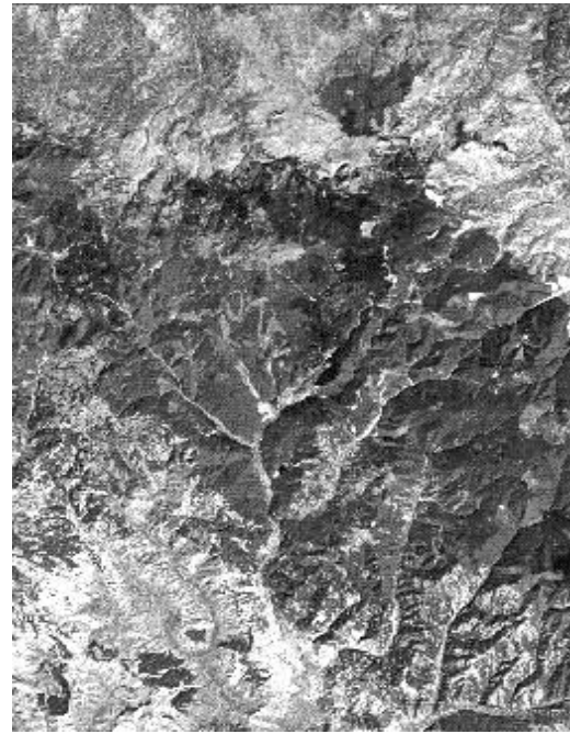
figure 2. Spatial image captured by LANDSAT-TM satellite using spectral band 7

The band used by recording surfaces in order to detect deposits of useful mineral substances is the band 7 (medium Infrared). The following picture (figure 2) represents an example of spatial capture to a topographic surface in this band.